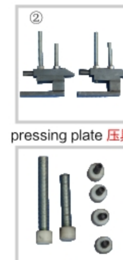
pressing plate 压具