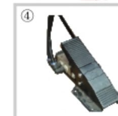
foot pedal 脚踏